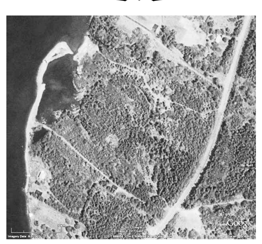
Site of Ben Eoin Marina ~ Coastal Barrier - Barachois Pond, East Bay